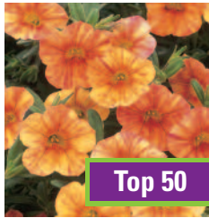
SUPERBELLS® Tequila Sunrise Calibrachoa hybrid USCAL151M' USPP17680