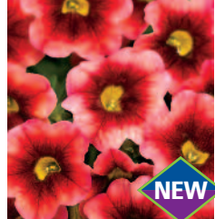
SUPERBELLS® Coralberry Punch Calibrachoa hybrid USCAL6604' USPPAF CanPBRAF