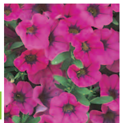
SUPERBELLS® Trailing Rose Calibrachoa hybrid Caltrabpr' USPPAF Can2303