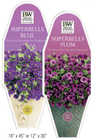
18" x 45" or 12" x 30" tag-shaped signs for several Superbells