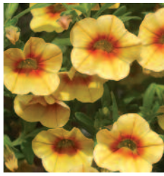
SUPERBELLS® Apricot Punch Calibrachoa hybrid USCAL1413-8' USPP19843 Can3634