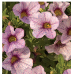
SUPERBELLS® Trailing Lilac Mist Calibrachoa hybrid KlEca07165' USPPAF CanPBRAF