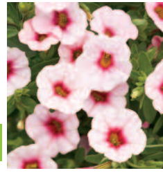
SUPERBELLS® Cherry Blossom Calibrachoa hybrid USCAL1212-1' USPP18421 Can3629