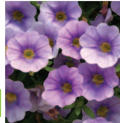
SUPERBELLS® Lavender Calibrachoa hybrid USCAL6601' USPPAF CanPBRAF