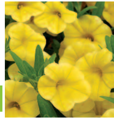
SUPERBELLS® Yellow Calibrachoa hybrid USCAL3302' USPPAF CanPBRAF