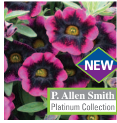
SUPERBELLS® Blackberry Punch Calibrachoa hybrid USCAL6604' USPPAF CanPBRAF