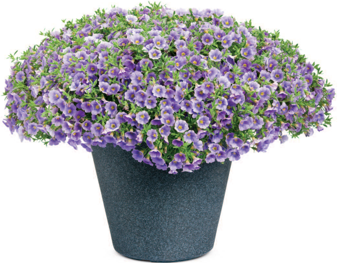
SUPERBELLS® Lavender Calibrachoa hybrid USCAL56501 USPPAF CanPBRAF

Superbells' superb color, heat tolerance, disease resistance, and large blooms make this series a star performer. With growth habits that range from the small and compact to the cascading, Superbells create endless possibilities in the landscape and in containers.