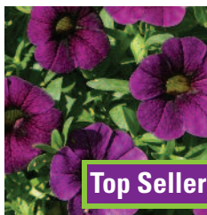
SUPERBELLS® Trailing Plum Calibrachoa hybrid Caltrabblpr' USPP18530 Can3612