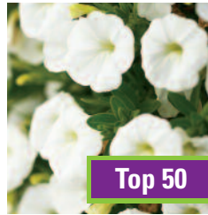
SUPERBELLS® White Calibrachoa hybrid USCAL1386-2' USPP19734 Can3630