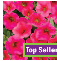
SUPERBELLS® Cherry Red Calibrachoa hybrid USCAL117' USPP15701 Can205