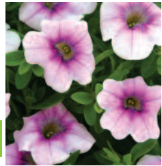
SUPERBELLS® Ticked Pink Calibrachoa hybrid USCAL1223-1' USPP18432 Can3301