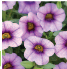
SUPERBELLS® Trailing Light Blue Calibrachoa hybrid Caltrablvr' USPP19177 Can3613