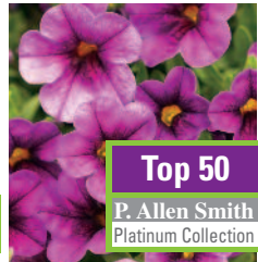
SUPERBELLS® Plum Calibrachoa hybrid USCAL1413-8' USPP17679 Can2869