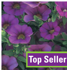
SUPERBELLS® Trailing Blue Calibrachoa hybrid Caltrababl' USPPAF Can2302