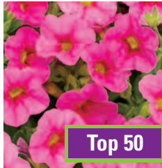
SUPERBELLS® Pink Calibrachoa hybrid USCAL111' USPP14988 Can1927