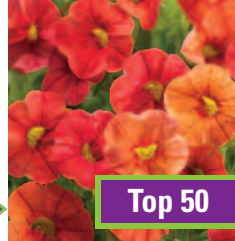
SUPERBELLS® Dreamsicle Calibrachoa hybrid USCAL117' USPP14874 Can1932