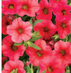
SUPERBELLS® Coral Calibrachoa hybrid USCAL1214-8' USPP18431 Can3300