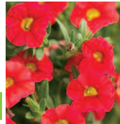
SUPERBELLS® Scarlet Calibrachoa hybrid USCAL1411-12' USPP19753 CanPBRAF