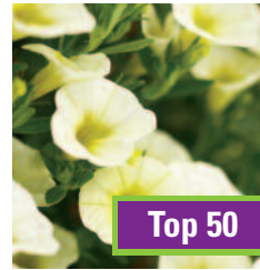
SUPERBELLS® Yellow Chiffon Calibrachoa hybrid USCAL1402-1' USPP19480 Can3631