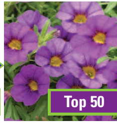
SUPERBELLS® Blue Calibrachoa hybrid USCAL1151' USPP14874 Can1931