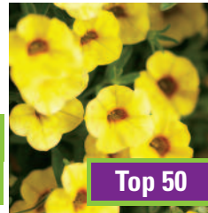
SUPERBELLS® Saffron Calibrachoa hybrid USCAL1413-4' USPP19493 Can3633