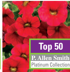
SUPERBELLS® Red Calibrachoa hybrid USCAL126' USPP14847 Can1928