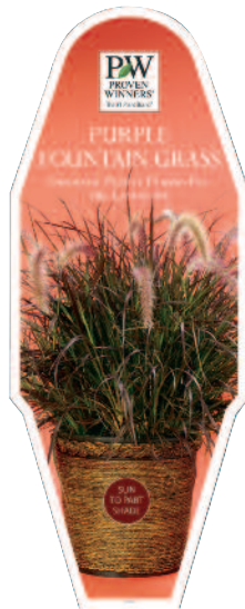
18" x 45" or 12" x 30" tag-shaped Purple Fountain Grass sign

Graceful Grasses sign – 18" x 18" and 23" x 23". Each sign is 2 sided on coroplast with a grommet in each corner. Matching 11" x 7" bench card is also available.