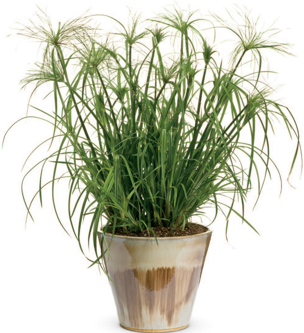
GRACEFUL GRASSES® KING TUT® Cyperus papyrus

Our Graceful Grasses® Collection has earned the praise of consumers because these plants are easy to grow and add height, texture, and color to the landscape and containers. Industry experts are fans as well. These seven plants in the collection continue to pick up awards for performance and beauty.