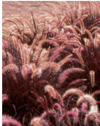
GRACEFUL GRASSES® Red Riding Hood Pennisetum setaceum