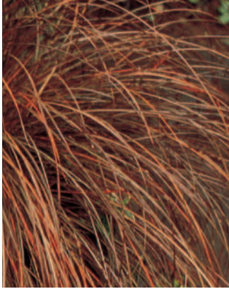
GRACEFUL GRASSES® Toffee Twist Carex flagellifera