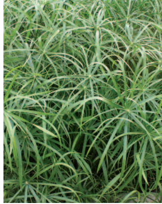
GRACEFUL GRASSES® BABY TUT™ Cyperus involucratus