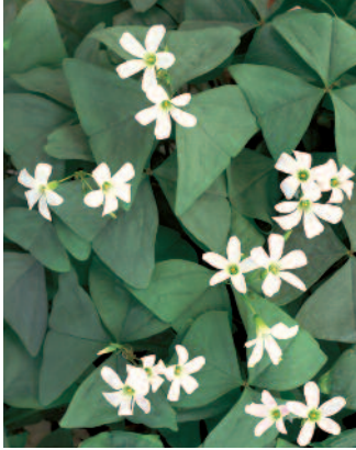
CHARMED® Jade Oxalis regnellii 'JROXFROJA' USPP17558 Can2826