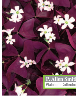
CHARMED® Wine Oxalis regnellii 'JROXBURWI' USPP17557 Can2949