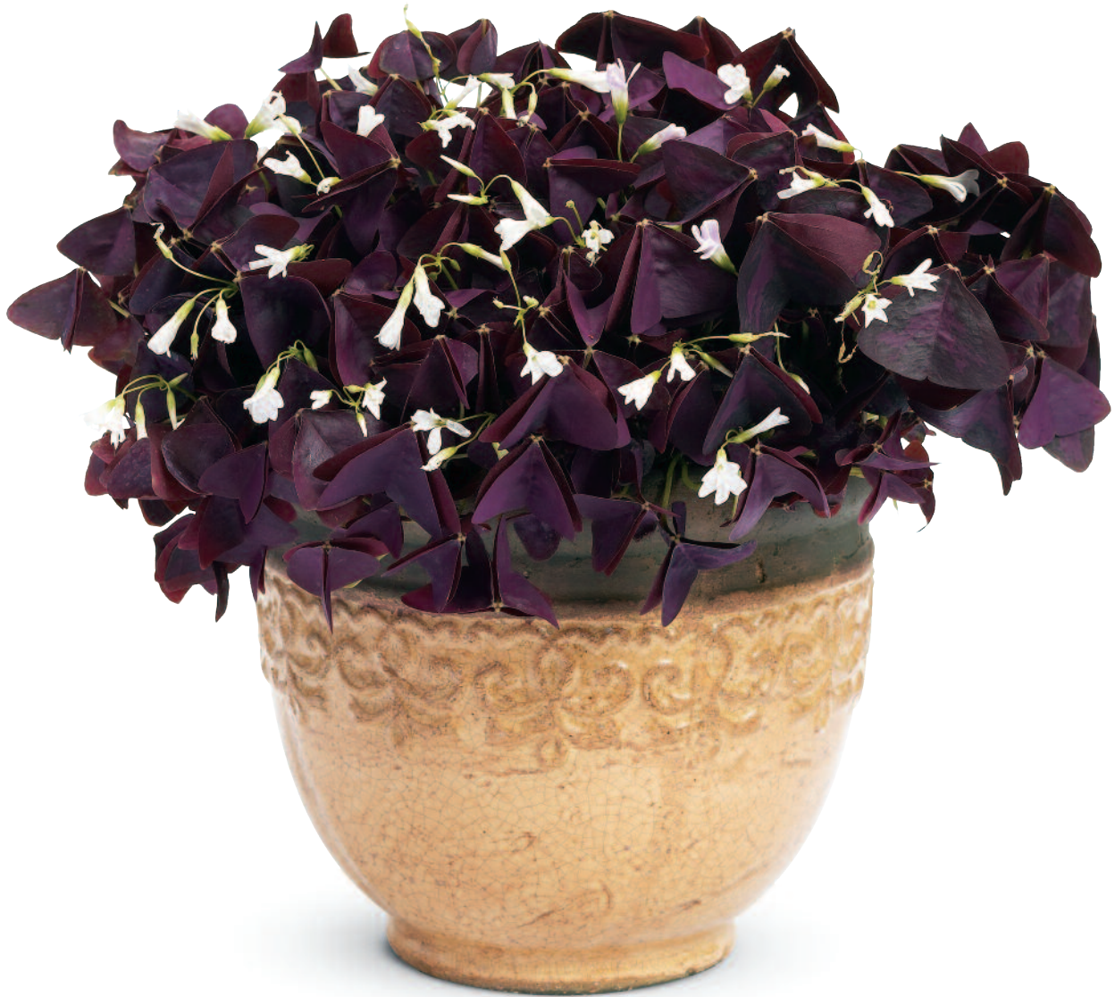
CHARMED® Wine Oxalis regnellii JIROXBURWY USPP17557 Can2949

An extra vigorous, shade-loving series, Charmed cultivars also have large, shamrock-shaped foliage and dainty flowers. Jade is the most vigorous plant in the series. The color and texture of Velvet set it apart, and Wine is ideal for mixed combos.