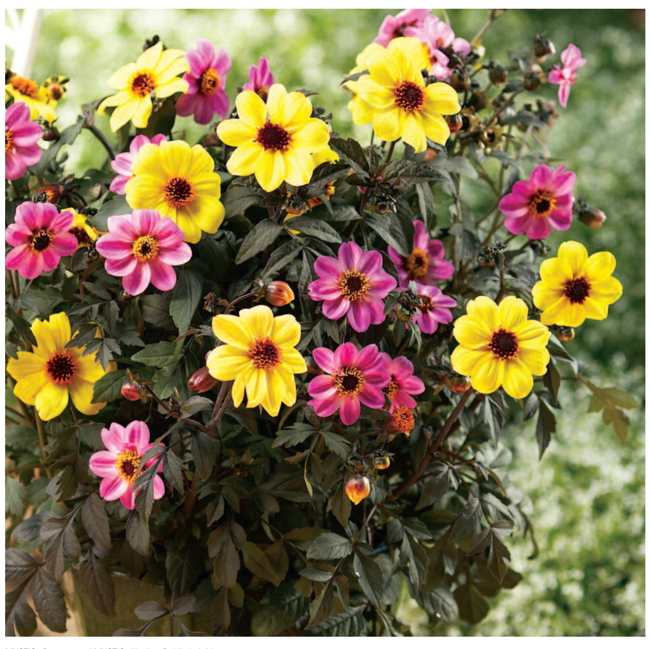
MYSTIC™ Dreamer and MYSTIC™ Illusion Dahlia hybrids

Some of the varieties are classic favourites, while others are unique introductions, but all of them are a result of selective breeding processes that produce hardier, more vibrant, and better blooming plants. They are beautiful alone or in combination with other Proven Selections or Proven Winners.