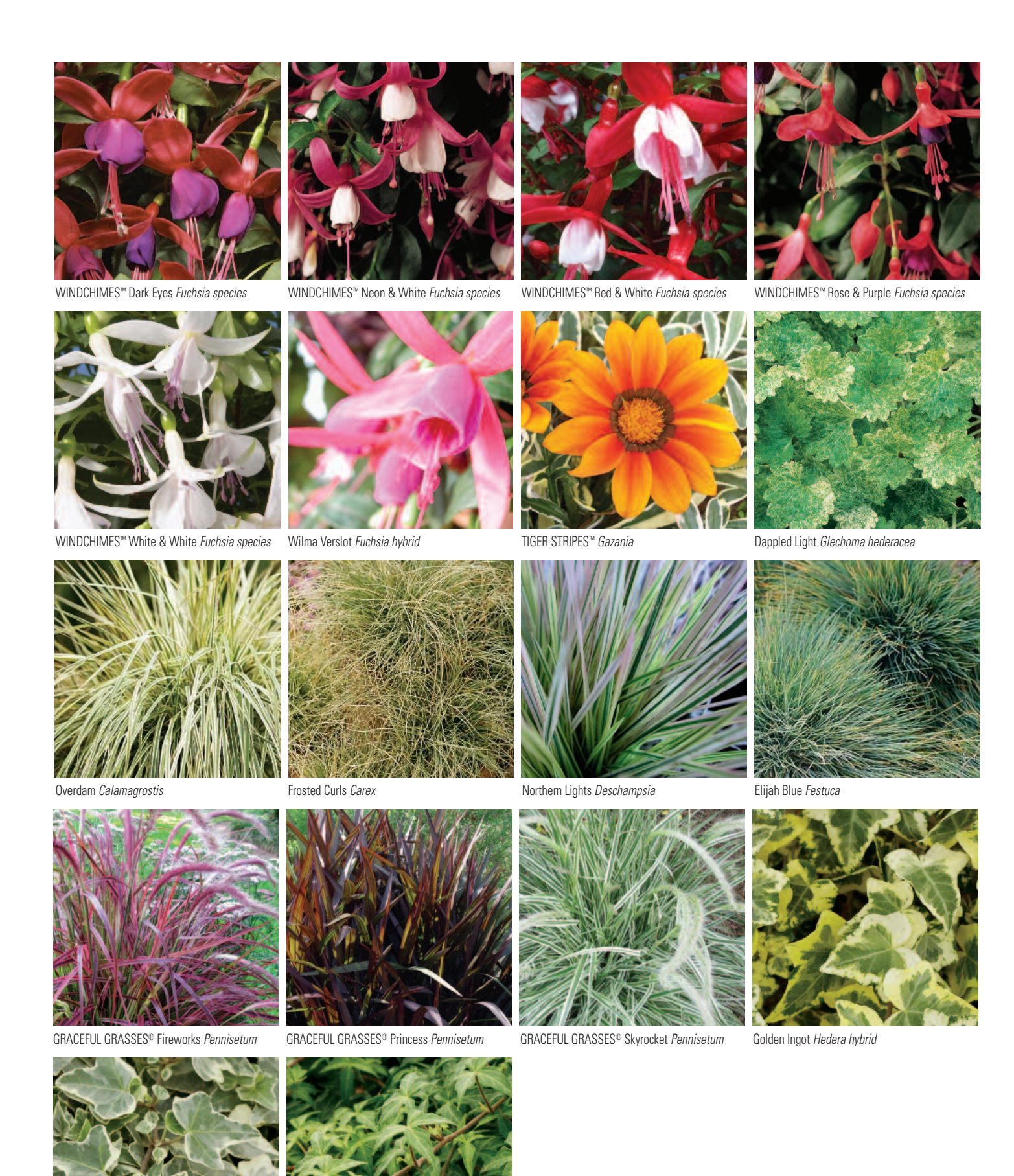
Glacier Hedera hybrid