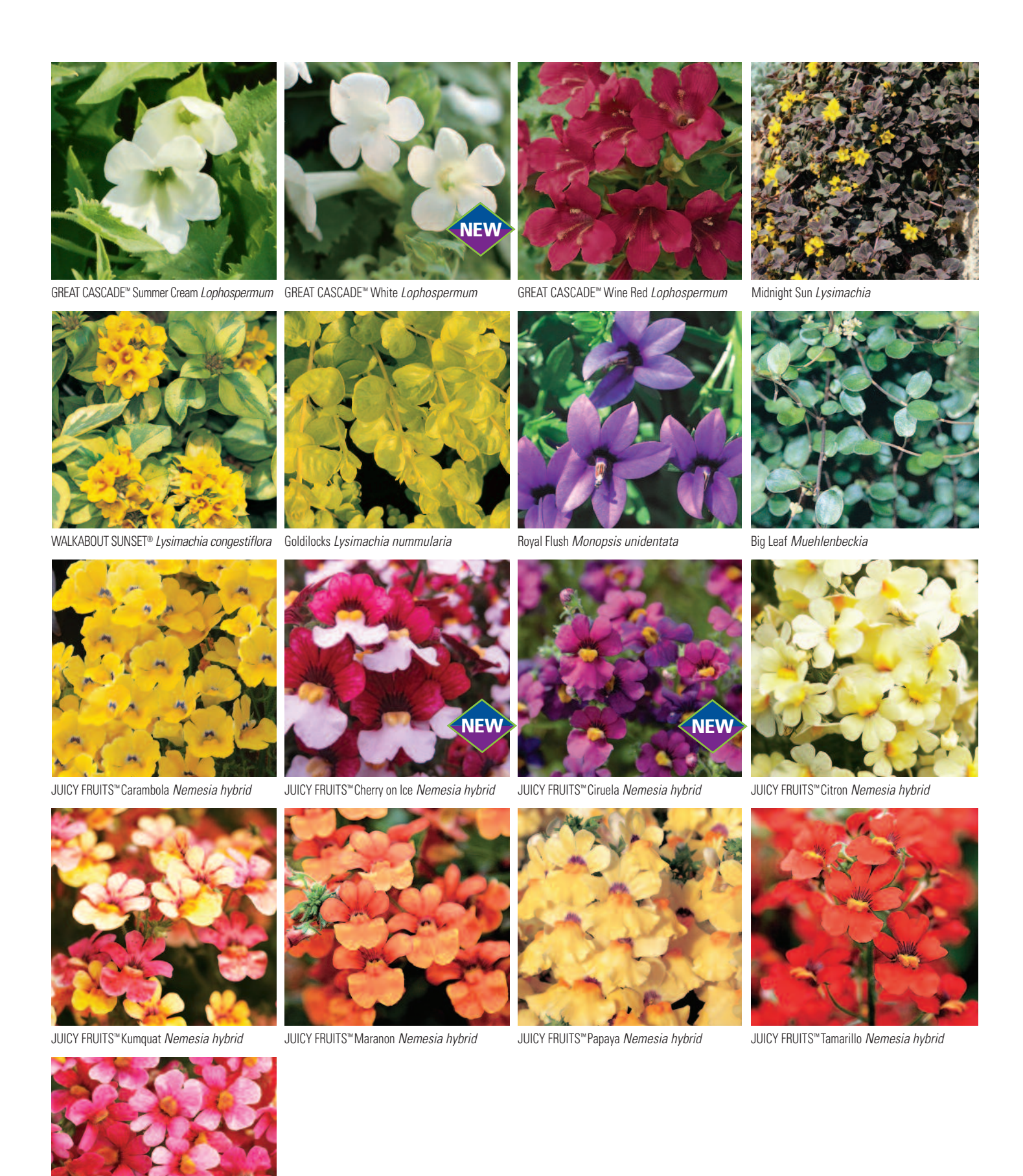
JUICY FRUITS™Watermelon Nemesia hybrid