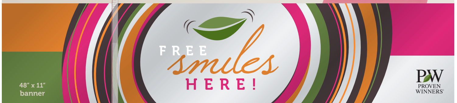
48" x 11" banner